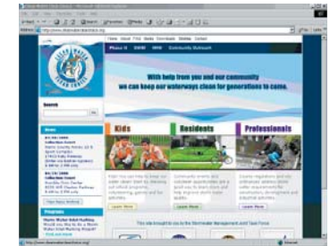
NEW Website Design