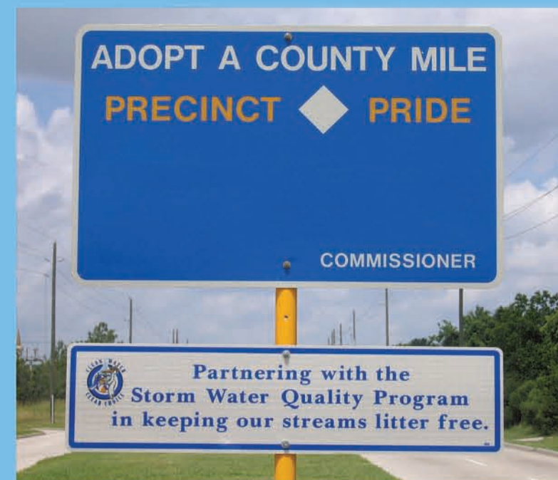
Adopt-A-County Mile Program