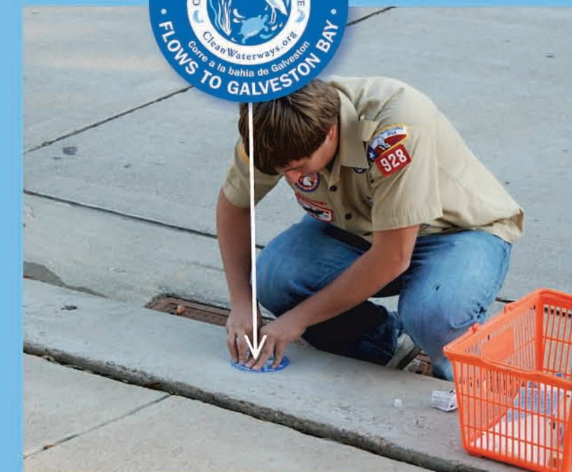
Storm Water Inlet Marking Program